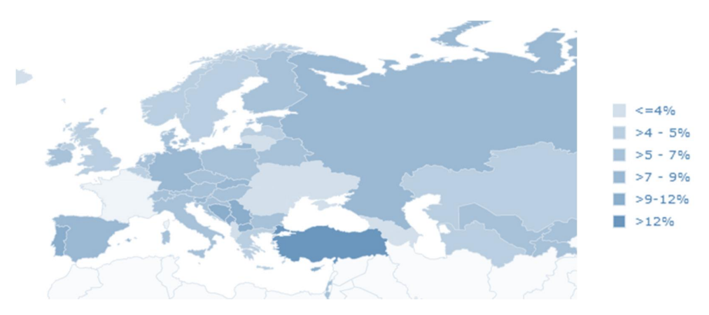
Figure 1. Comparative diabetes prevalence rates in Europe, SOURCE: Diabetes Atlas Map, http://www.idf.org/atlasmap/atlasmap

Complications of diabetes are the main cause of death in patients with the disease. The leading cause of death in persons with diabetes are cardiovascular diseases, the risk of cardiovascular disease being eight times higher in persons with diabetes. Diabetes is also a significant risk factor for cerebrovascular insult, especially in women (5.4 times greater risk). Diabetic retinopathy is a major cause of blindness, nephropathy is the most significant cause of renal failure, and diabetic foot is the leading cause of amputations of lower extremities and the most significant cause of disability in the diseased.