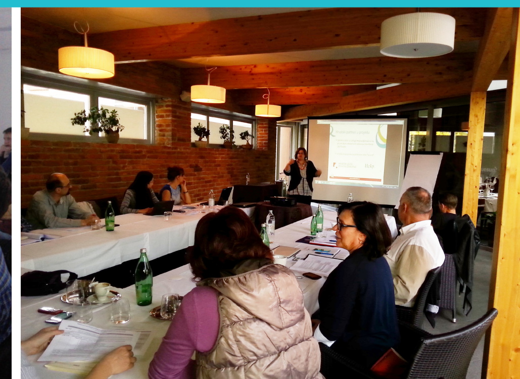
Workshop on development of Harm Reduction Guidelines, Croatian Office for Combating Narcotic Drugs Abuse, September 18-19, 2014, Marija Bistrica