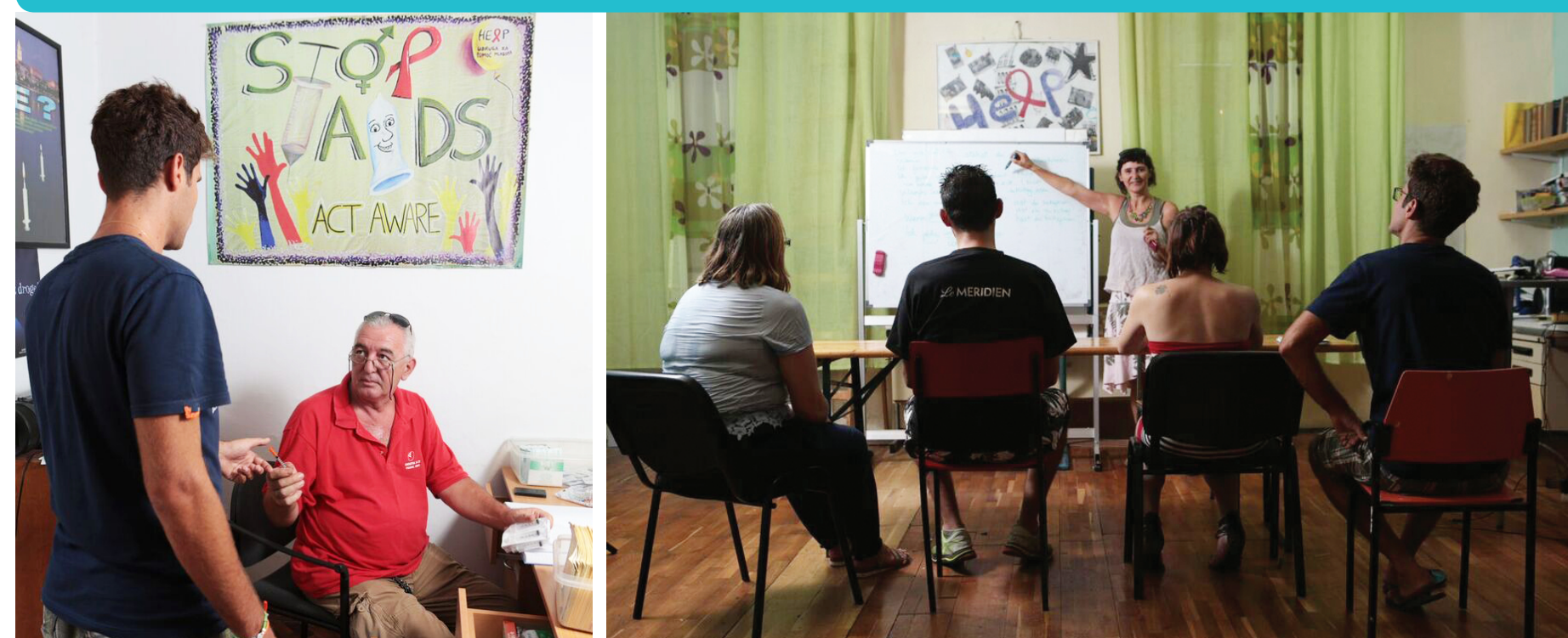
NGO HELP's Drop-in harm reduction program, October 15, 2014