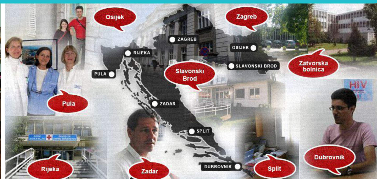
Network of VCT centers in Croatia, December 10, 2014