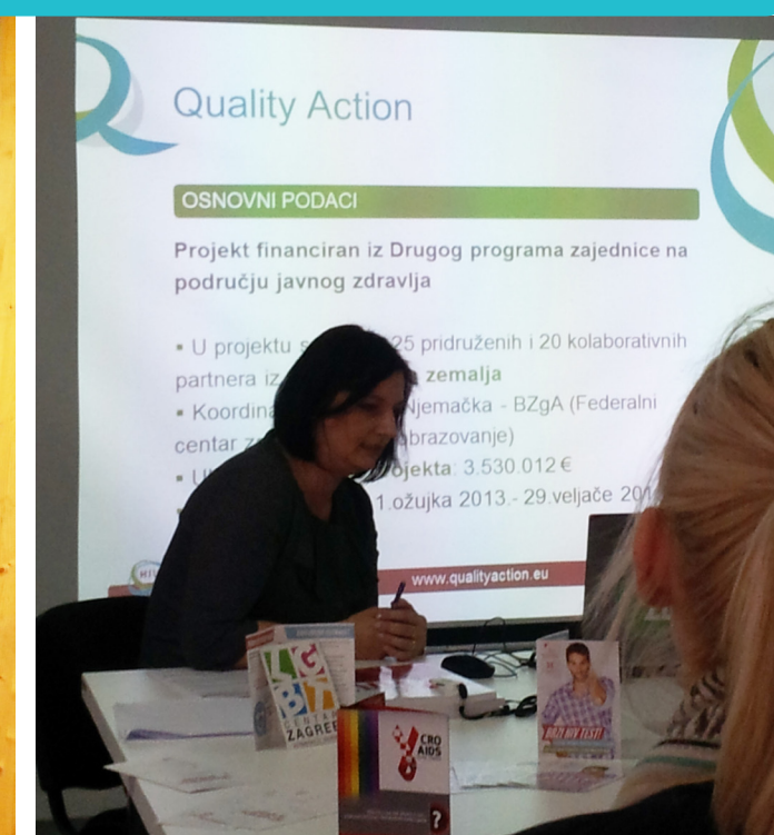
Workshop on HIV testing and counselling for counsellors working at the LGBT center, CIPH, October 3, 2014, Zagreb