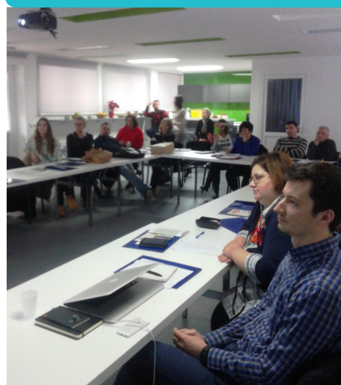
Workshop on HIV counselling and testing – „Ten years of VCT centers in Croatia – a step towards comprehensive sexual health“, CIPH, December 16, 2014, Zagreb